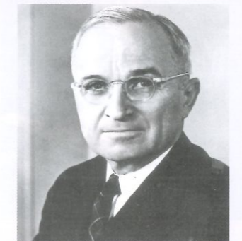
Fig. 1 Truman saw the US through the end of the Second World War

Harry S Truman (1884–1972) , the 33rd president, had been vice president under Franklin Delano Roosevelt (FDR) for less than three months when FDR died. Dealing with the post-war fall out, communism at home and abroad, as well as civil rights issues and an economy in transition, Truman plumbed depths of unpopularity in opinion polls. However, his uncompromising and honest approach (he had a sign on his desk that read 'the buck stops here') saw him re-evaluated on his death in 1972.