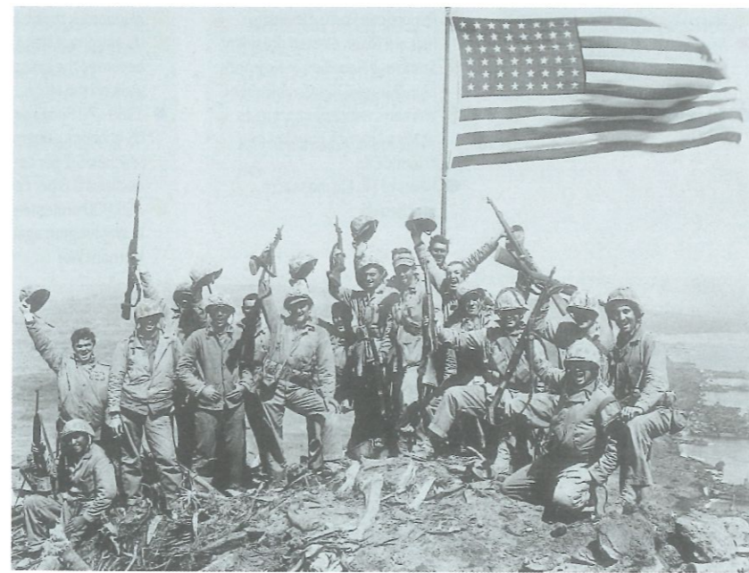
Fig. 1 US marines raise the American flag atop Iwo Jima, Japan, towards the end of the Second World War in 1945

The period from 1945 to 1980 was a time of economic growth, of nuclear fear and of heroic movements for civil rights. Yet it was also a time when the presidency itself came under scrutiny from a growing media, a frustrated Congress and through the actions of, perhaps, the defining figure of the era, Richard Nixon, president between 1969 and 1974. The media became the lens through which Americans experienced their government, the products they could buy and the rest of the world and the growth of the various media outlets: TV, radio, film, magazines and newspapers is entwined with the political, social and economic events and changes in these years.